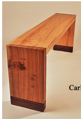
Carl Yurdin, Ash/Walnut Bench 439